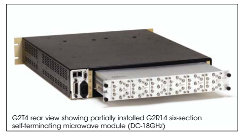
G2T4 rear view showing partially installed G2R14 six-section self-terminating microwave module (DC-18GHz)