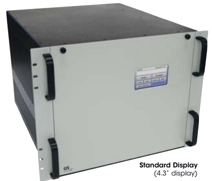
Standard Display (4.3" display)

Universal Switching's policy is one of continuous development, and consequently the company reserves the right to vary from the descriptions and specifications shown in this publication.