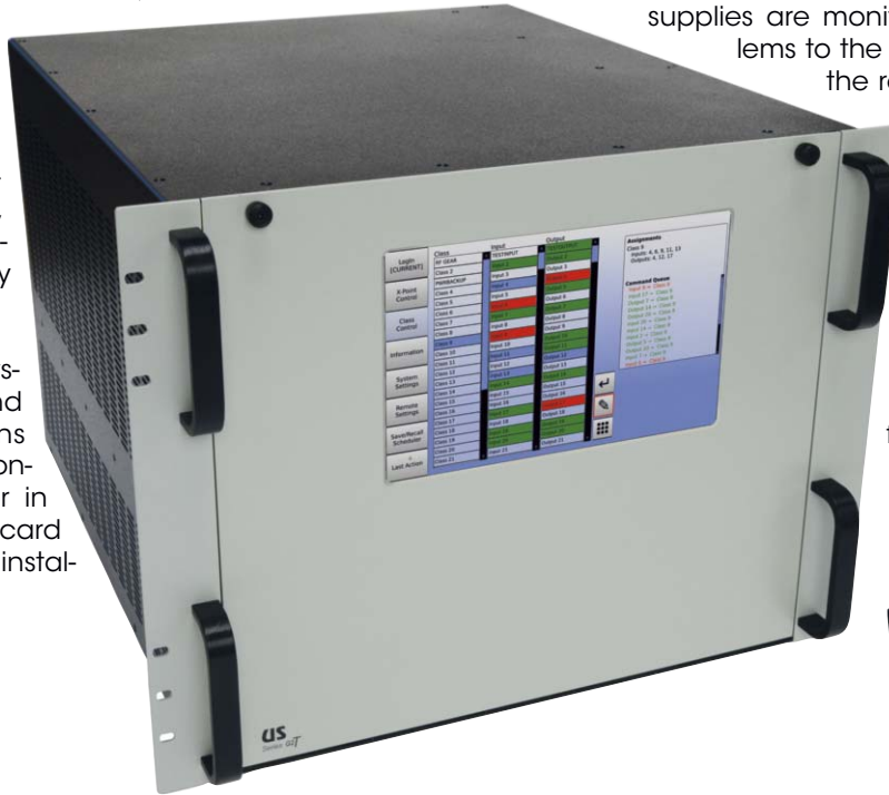
Shown with Option X (10.1" display)

For a bigger display add the "Option X" to upgrade the standard 4.3" display to a beautiful 10.1" with more features (shown to left).