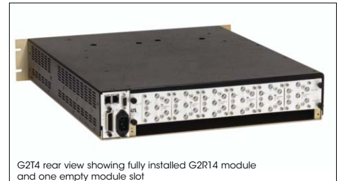
G2T4 rear view showing fully installed G2R14 module and one empty module slot